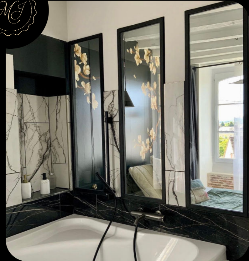
FIXED GLASS PARTITION