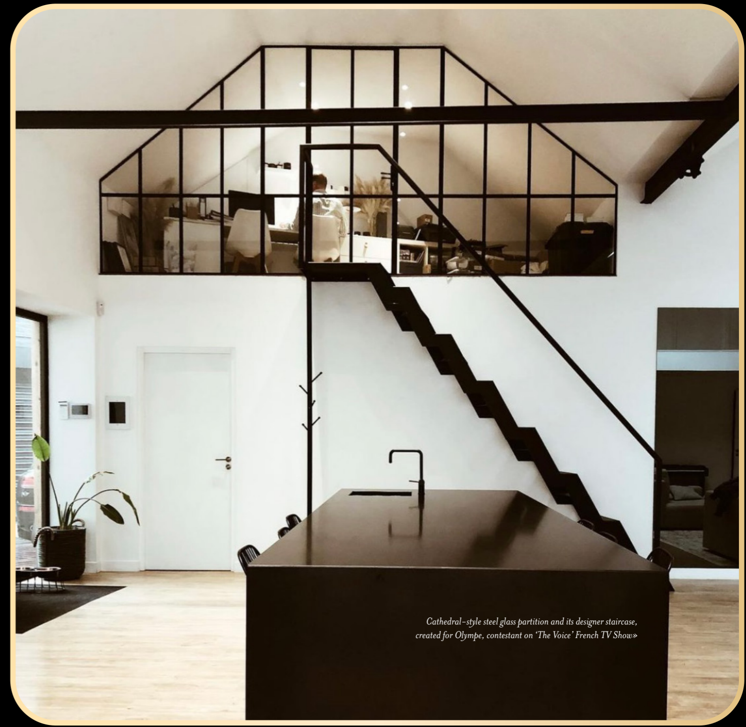
Cathedral-style steel glass partition and its designer staircase, created for Olympe, contestant on 'The Voice' French TV Show»